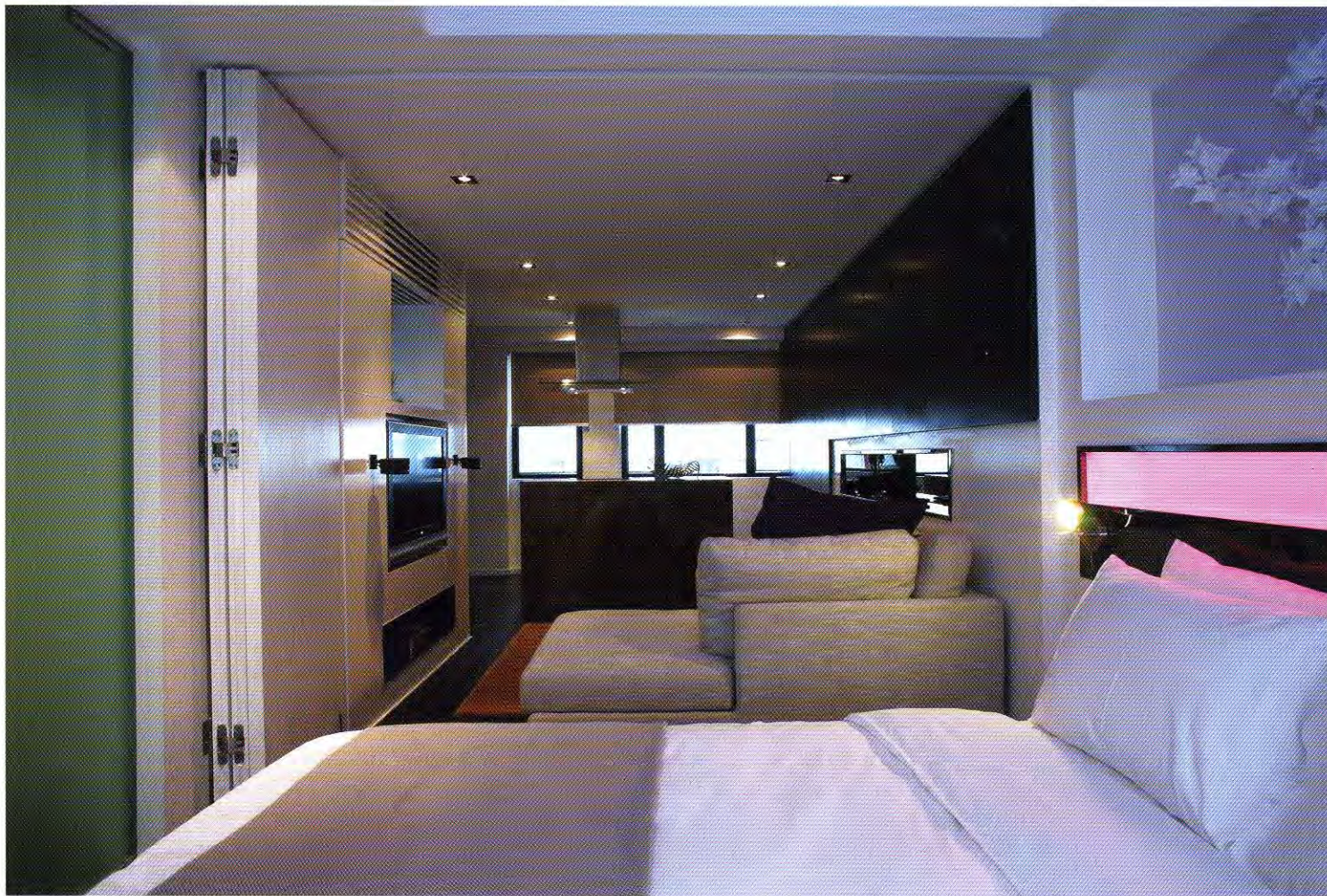
above A discreet folding door serves as both a room-divider and camouflage in the flat's living area and bedroom opposite page, clockwise from top A versatile 'Rock Island' kitchen serves as the heart of the flat's design concept • Nestled amidst old Chinese tenements in Hong Kong's Western district, the modern 'tong lau' creates a dramatic impact • The limited space in the room was overcome by creating compact kitchen that encloses the utilities within cupboards

"The contrast between the raw and the slick, the crude and the sophisticated between the entrance and the rooms, co-relates to the 'work and play' concept of the design"