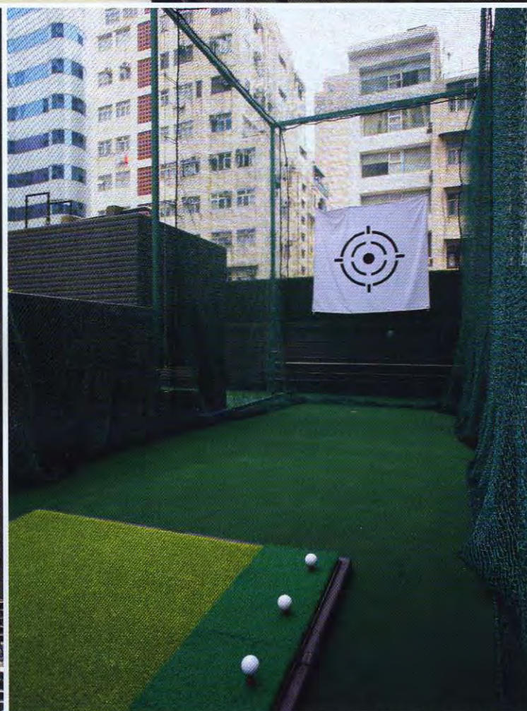
clockwise from top 'Black Nature' design elements adorn the bathroom interiors • A putting range was laid out on the building's rooftop in keeping with its 'work and play' concept • Graphics portraying structures of Hong Kong complement the building's rugged staircase and sleek gold mirrored stainless steel balustrades