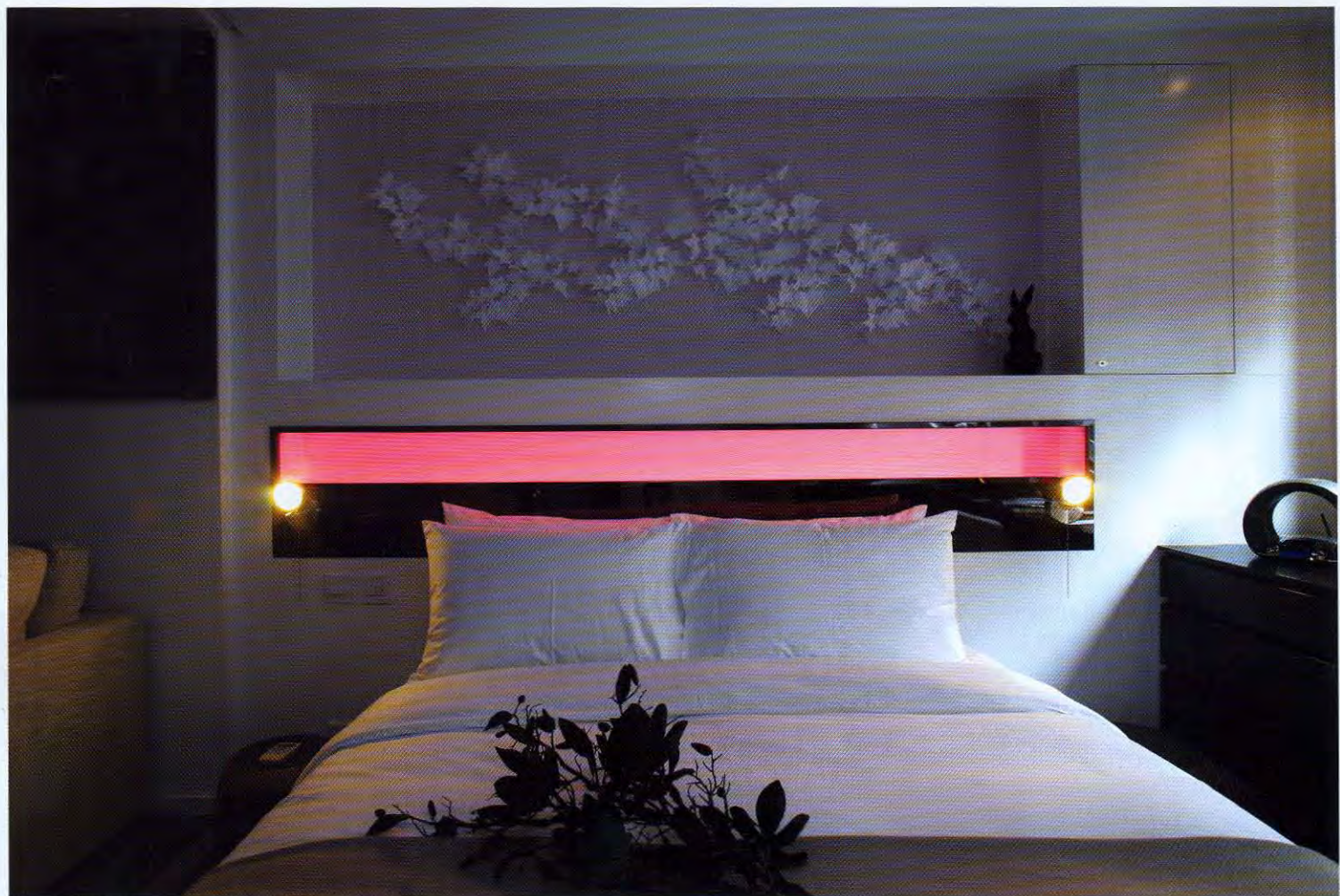
above Lighting in the apartments is colour coded to match moods and create instant ambience